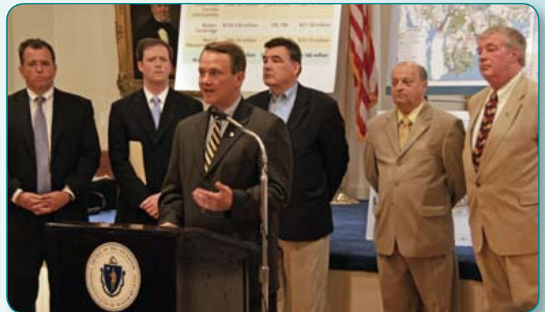
Lieutenant Governor Murray announces third round of technical assistance awards.

The Executive Order calls for the state to align its investments in infrastructure and land preservation with the Corridor Map, which was developed through an extensive civic engagement process involving over 100 community meetings. The map identifies 33 places that are priorities for new job and housing growth and 72 places that are priorities for protecting natural lands. State investments affected by the Executive Order include water, wastewater, transportation, housing and economic development, and land preservation, as well as the construction and leasing of state facilities.